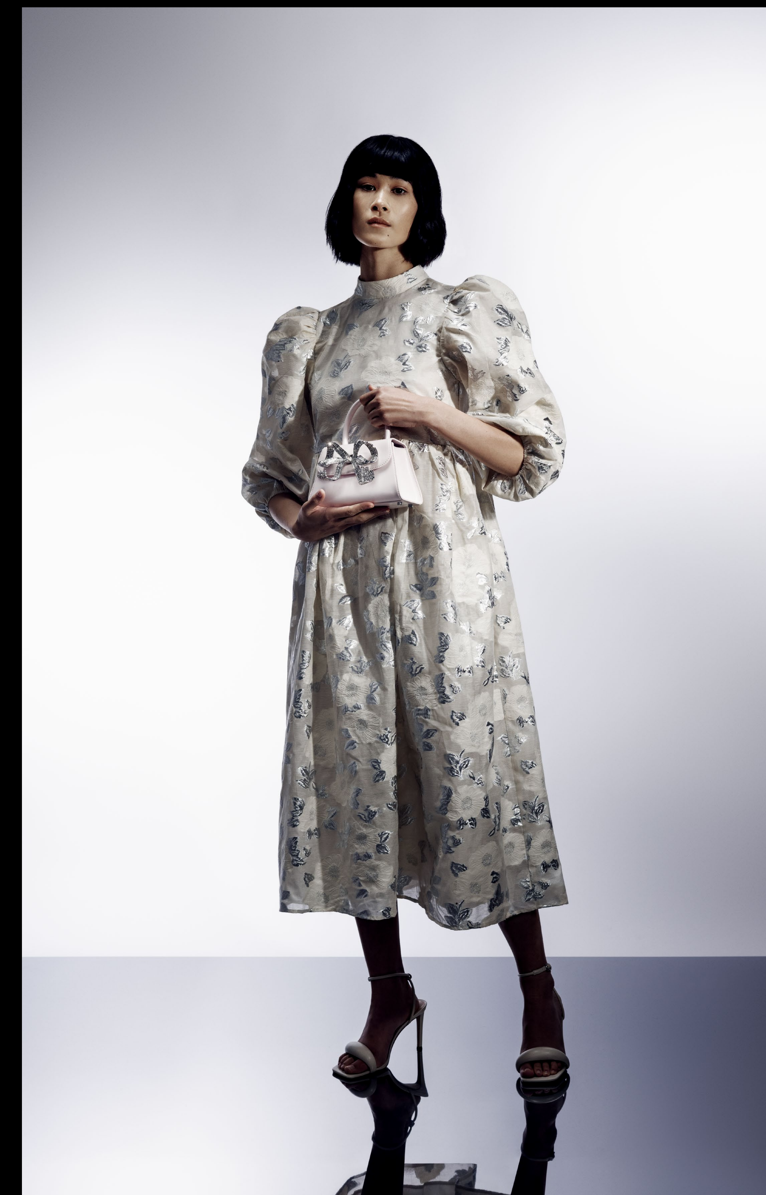
ARNOTTS SPRING LAUNCH, 2023